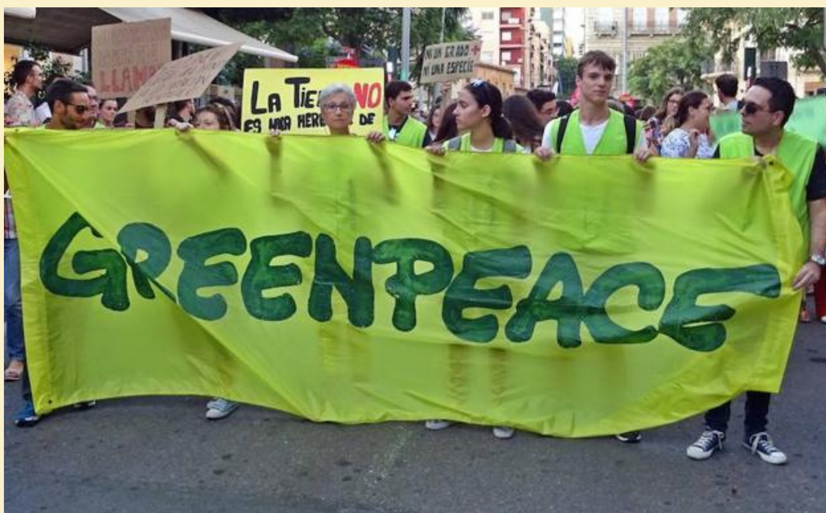
Commemoration August 12, 2019

Due to the theme that is celebrated today, we have decided to highlight one of the organizations that puts the most care in caring for our planet Greenpeace is a company that motivates others to join the boom in caring for the planet.